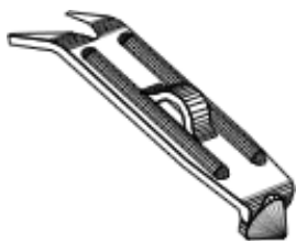
Earthwings Model # 3C

For trees up to 2" in caliper, holding power approximately 250 lbs.