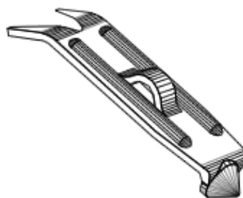
Earthwings Model # 5C

For trees up to 3" in caliper, holding power approximately 300 lbs.